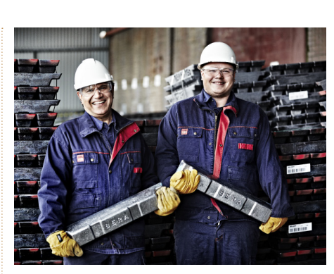
Brussels nomenclature 78011000

By becoming Boliden's partner, we want to help you add value to your customers and work with you for a more sustainable future.